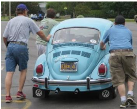
Not even an empty gas tank kept this guy away.