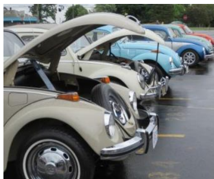
Nothing Bugs Phil.