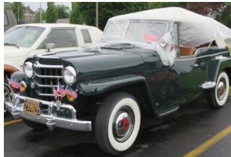
Factory rain gear. Custom rain gear. Who wore it best?