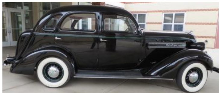
Mueller's had the best parking spot.