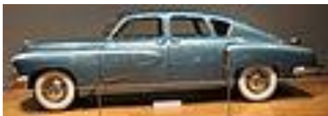
The 1948 Tucker